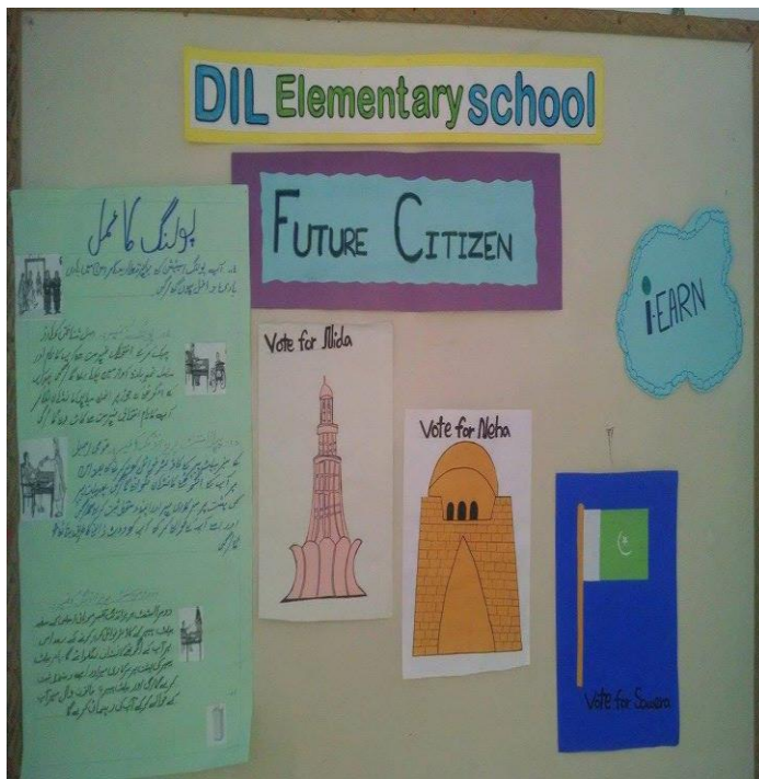
Students' work from the PBL activity